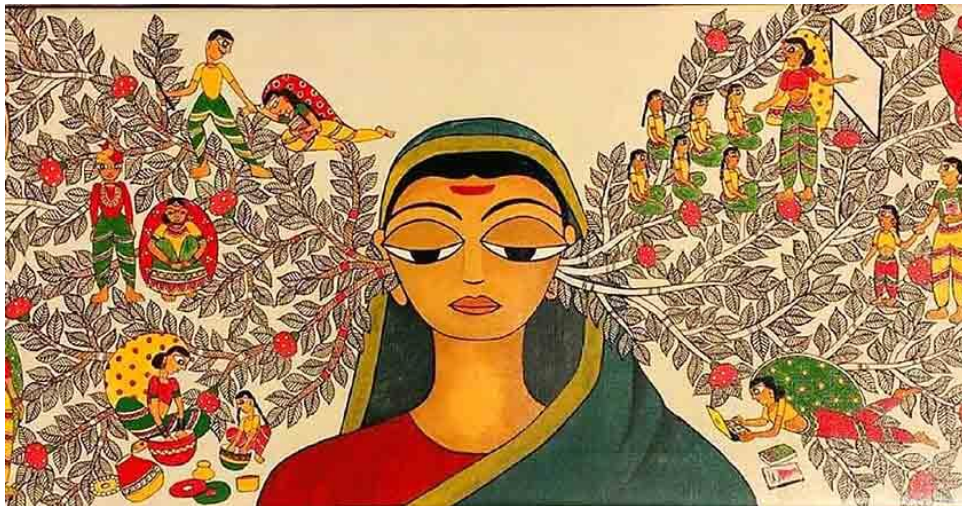
Remembering the Goddess of Education