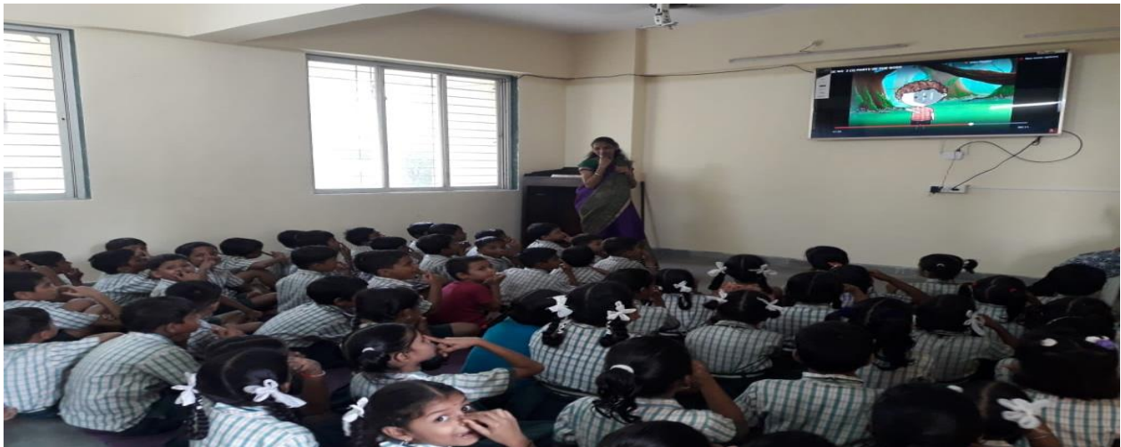
E Techeing program at Alibag all ZP Schools

affecting the citizen of Mumbai. Listening, reading and writing are the three main pillarsof language development. Listening which begins in the womb and continues through the early years of a child's life enabales a child to articulate from incoherent to coherent words, form words, through phrases to sentences which get refined as the child.